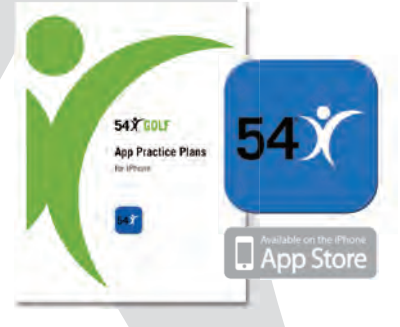
App Practice Plan – A free resource full of practice plans, based on different intentions, to enhance your practice sessions with the app. Available for download on our website.

Additional resources, tools, and our in-person program schedule can be found at VISION54 .com